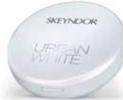
MATT POWDER COMPACT

A treatment formula for hands with aged skin and skin spots. Contains three active ingredients which unify the skin tone, redensify its appearance and counteract the aesthetic damage caused by the sun and tobacco (tar, toxic agents, etc). With SPF15 protection.