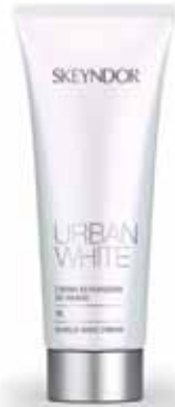
SHIELD HAND CREAM

With a specific formula containing wide-spectrum de-pigmentation agents created to quickly lighten the tone of all types of skin spots or pigmentation. Apply only to pigmented areas.